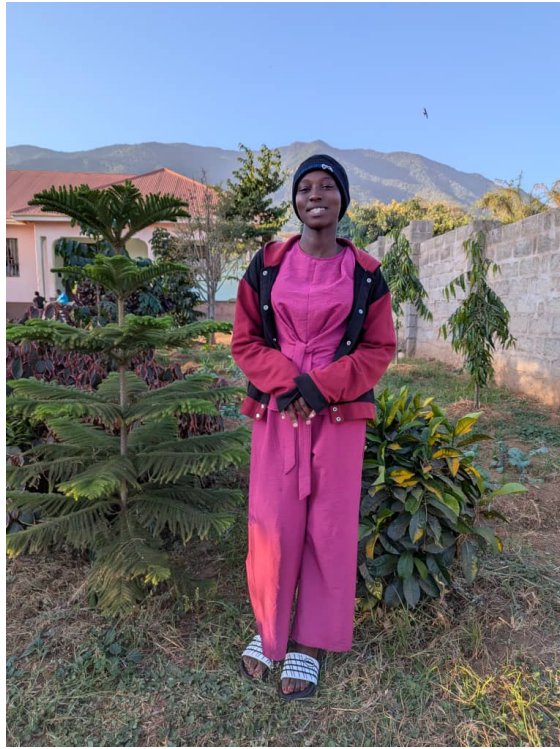
Salome now in 2026.