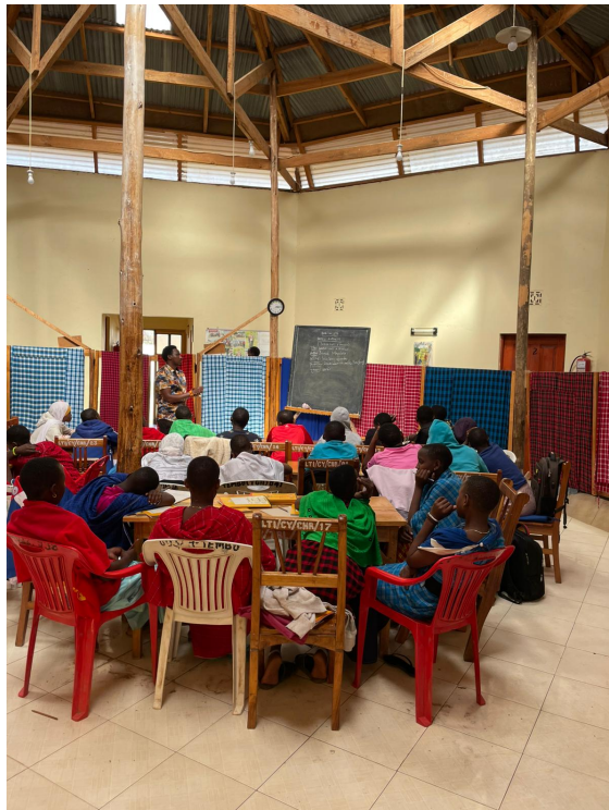
Class is in session at TEC.